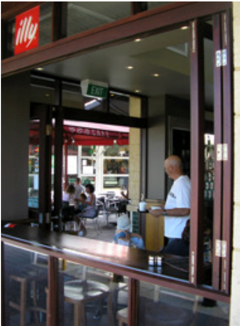
An open fronted café providing 'eyes on the street'