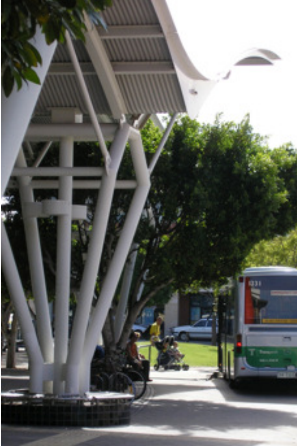
The bus and rail interchange.