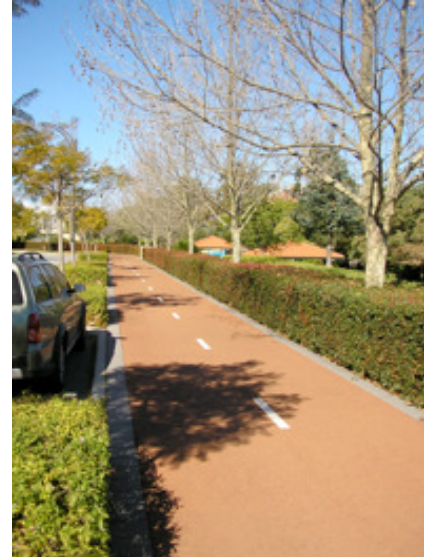
A shared use path linking Subi-Centro to the city and ocean