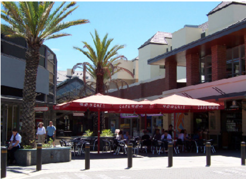
Shopping activities fronting the rail station forecourt.

Subi Centro is recognised both nationally and internationally as an exemplar in urban regeneration and transit-oriented development. Subi Centro provides a network of bikeways, greenways and civic squares creating a variety of connected and accessible public spaces for an inclusive and accessible community.